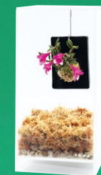
Neo Glass Air W15×D15×H25 (cm)