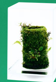
Neo Glass Air W20×D20×H30 (cm)