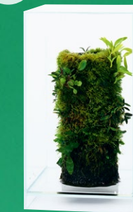
Neo Glass Air W20×D20×H35 (cm)